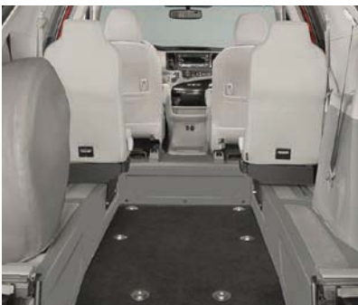
Aftermarket 2nd Row Bucket Seats